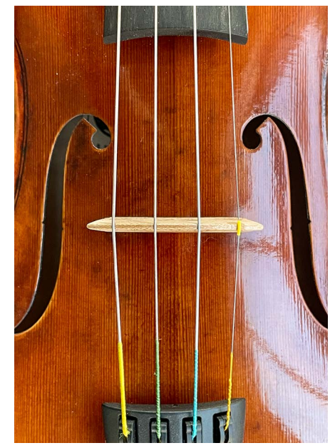
The bridge is centered between the notch in the f-holes, lines up with the fingerboard, and is standing up straight. Each string is in the groove made for it by the luthier.

keep being pulled by the strings as you tune them and will need to be pulled back. Since the pressure exerted on the bridge by the strings in on the top of the bridge, it is the top of the bridge that you need to exert pressure on to straighten it. If you try to push the bridge in the middle, it is very easy to break the bridge. Watch the feet to make sure that they are still in place on the top. Check the end pin again.