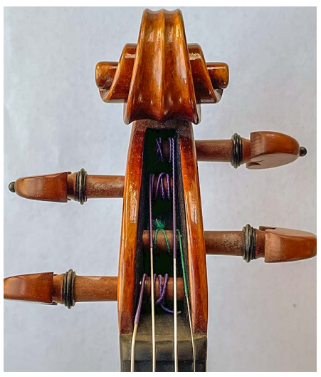
The strings are wound on the pegs as shown. When tightening the strings, go slowly. Too much tension and the string will break.

If the end pin is fitted optimally, it will be snug, and will not move when there is no tension on it. This is important because if it is not snug, it may tend to keep sticking out as you try to tune the instrument up. If that's the case with your instrument, you may need a new end pin. This is a job for the luthier. End pins are not interchangeable.