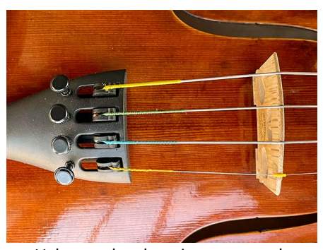
Make sure that the strings are securely anchored in the fine tuners in the tailpiece, or if there are no fine tuners, in the holes in the tailpiece.

tension up on those two strings just until they are holding the bridge in place.