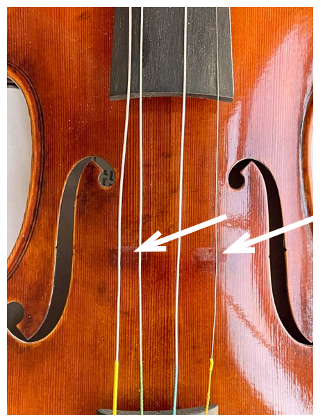
Most instruments, even new ones, will have marks on the top where the bridge has been.

When stringing an instrument after the bridge has been off, it's good to do the work on a stable surface with good lighting, like a table with a window or a good lamp. It's good to protect the instrument by placing something under the instrument, like a blanket or a towel, and it's good to protect the top of the instrument by putting something under the tail piece, like a piece of cloth, or stiff card stock.