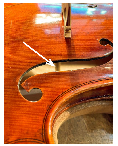
Before setting the bridge back up, check to see if the sound post is still standing in its place inside. If not, it's time to get a trusted luthier to set it up.

There are many reasons why a bridge may not be attached. One might assume that the bridge would be glued on to the top, but it is only held in place by the pressure of the strings pushing down on it. When all of the string tension is taken off, there will be no pressure down on the bridge. Sometimes when this happens the sound post inside the instrument may fall over. In my experience, a sound post that is fitted optimally will not fall over if the bridge falls. If the post is down, a luthier will need to check it to see if it can be set back up, or if the instrument needs a better fitting post.