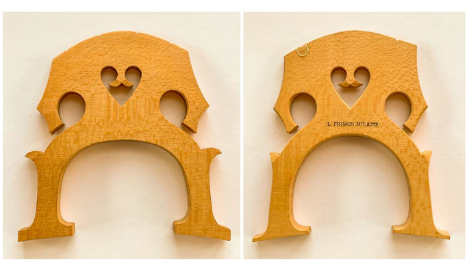
This cello bridge was hastily made. It is heavy and clunky.

A well-cut bridge is a marvel of design, engineering, art and craftsmanship. Some bridges are heavy looking, thick, and clumsy. Some are light, efficient, and graceful. The process of fitting a bridge to an instrument takes time and care.